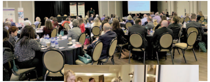
Attendees were fully engrossed while listening to the Keynote speakers (above), and enjoyed visiting vendors tables in between events (right).