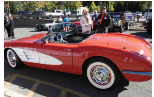
Right: October's annual Tailgate Luncheon featured a picnic of delicious BBQ from the Mason Jar, along with great vintage cars and a sampling of new 2019 models.

New and prospective members are invited to attend MRCC's quarterly Member Benefits Overview Breakfast for a look at the many opportunities the Chamber offers its members. Please join us on February 12 or May 14. Register at mahwah.com